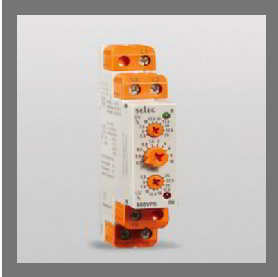
Analog Voltage Protection Relay (310/520V)_600VPR