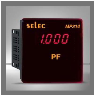
Advance Power Factor Meters