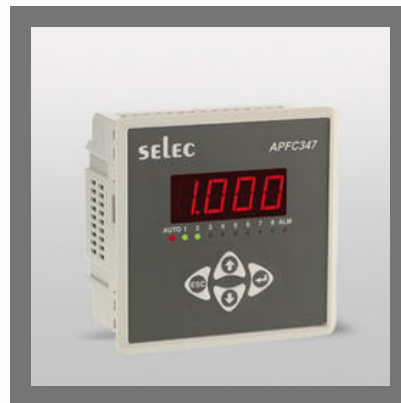
APFC, LED, 8 Stage_APFC347