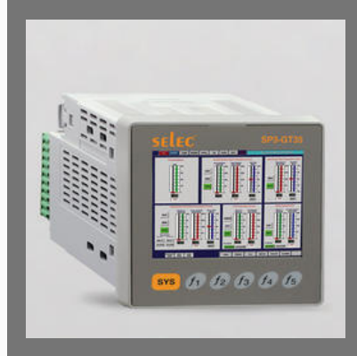
PLC, 3.5" Touch Screen HMI Modular_Flexys GT35