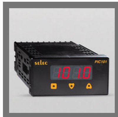
Process Indicator with Temperature Voltage Current PIC101N