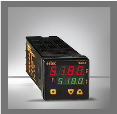
Single Set Point Temperature Controller_48x48MM_TC518