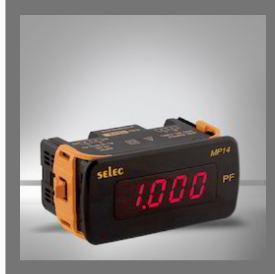
LED Power Factor Meters