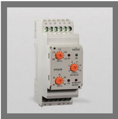
Analog Voltage Protection Relay VPRA2M