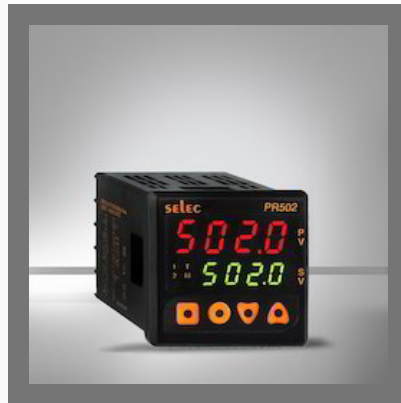
Profile Temperature Controller_PR502