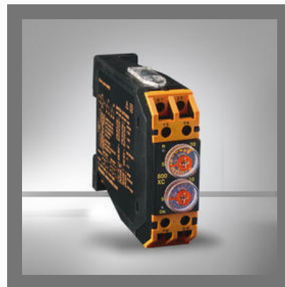
Timer, Cyclic. 6 Time Ranges_800XC