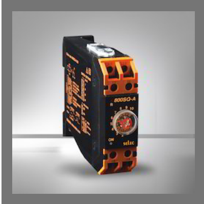
Powerful Din Rail Mounted Timer