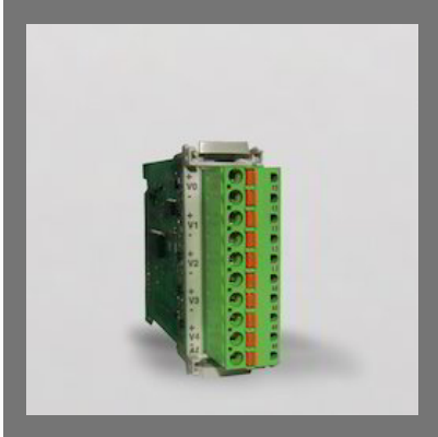
IO Cards For Flexys Flexys IO Cards