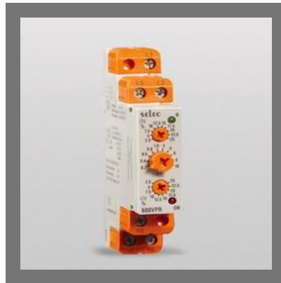
Analog Voltage Protection Relay(170/290V)_600VPR