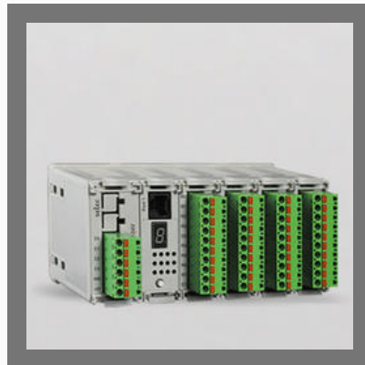
PLC, Rail Mount Modular_Flexys Rail