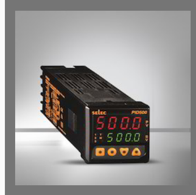
Advanced PID with Universal Input (48x48MM)_PID500