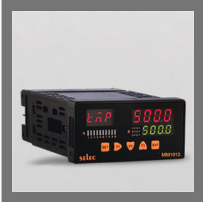
6DI 4RO 2 AI(TC/RTD,0-10V,0-20mA) 1AO (0-10V/0-20mA) MM1012