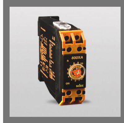
Timer, ON Delay/Interval, 8 Time Ranges_800XA