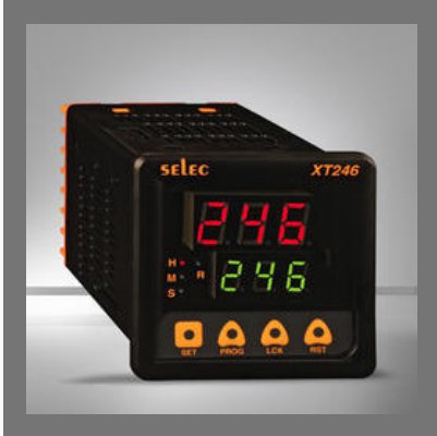
Dual Display Multi function Timer