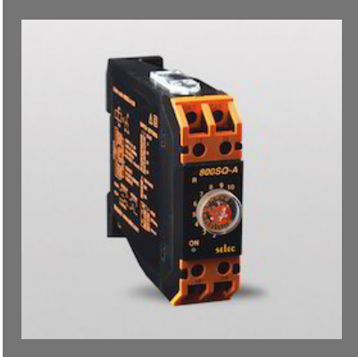
Timer, ON Delay/Interval, 8 Time Ranges_800SQ-A