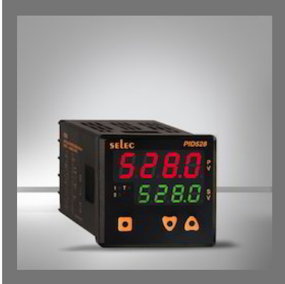
Dual Display Dual Set Point Economic PID Controller_PID528