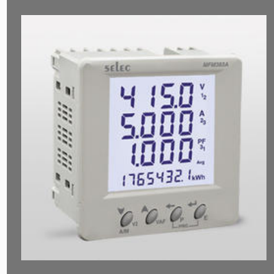
Meter Multifunction, LCD MFM383A