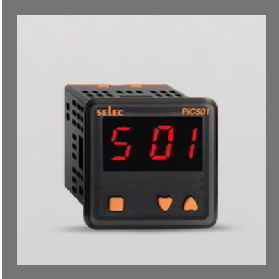
Process Indicator Voltage Current PIC501A-VI-230