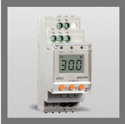
Digital Current Protection Relay 900CPR-1