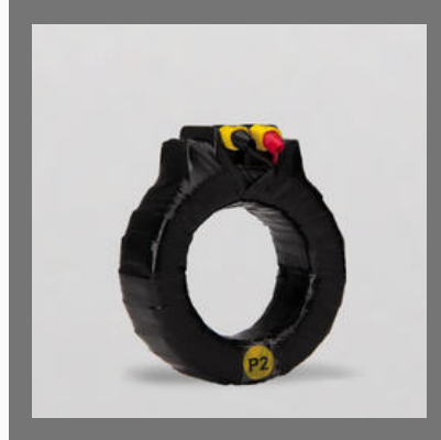
Current Transformers_ Tape Wound Type,30 To 1600A _TWCT