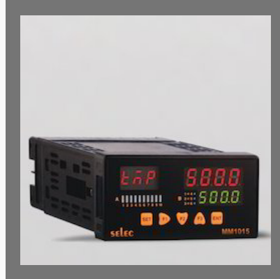
PLC, HMI, 10DI 6RO MM1015