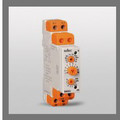
Timer, 13 Functions_600XU