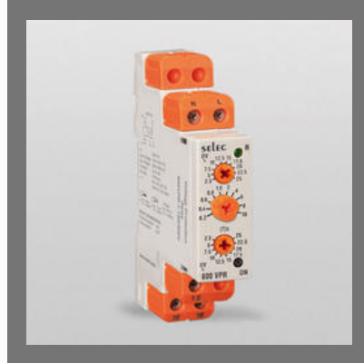
Analog Voltage Protection Relay 600VPR-1-180/300V