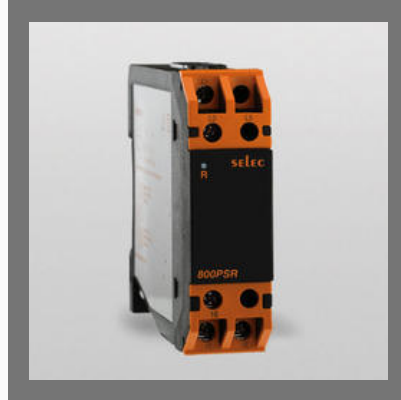
Phase Sequence Relay, 22.5mm_800PSR