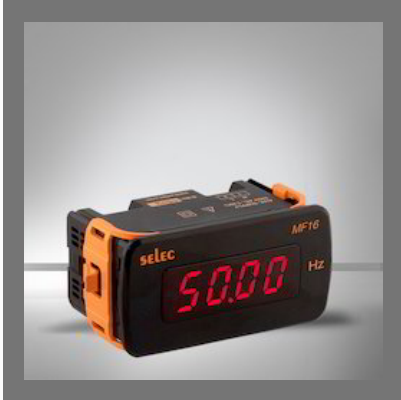
LED Frequency Meters