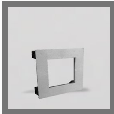
Adapter Plate_48 X 48mm In 72 X 72mm Cutout_AP7248