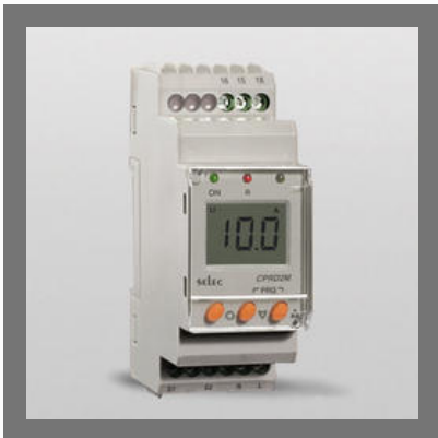
Digital Current Protection Relay, 10A Relay_CPRD2M