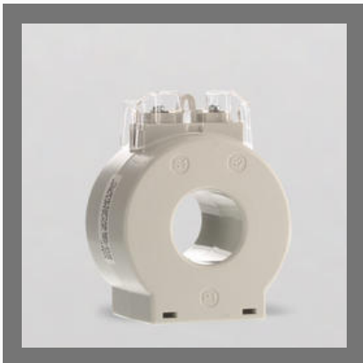
Current Transformers_Cable type Round CT, 30 to 600A _RCT