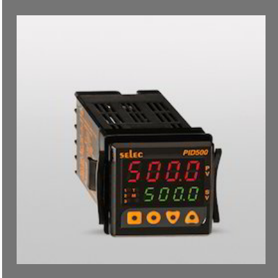
Advanced PID with TC/RTD Input (48x48MM)_PID500-T