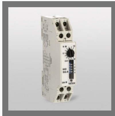
Timer, 2 Functions_642SQ- A