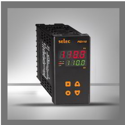
Temperature Advanced PID with Universal Input_PID110