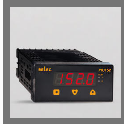
Process Indicator With Retransmission 2 Alarms PIC152