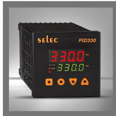
Temperature Controller Advanced PID_PID330