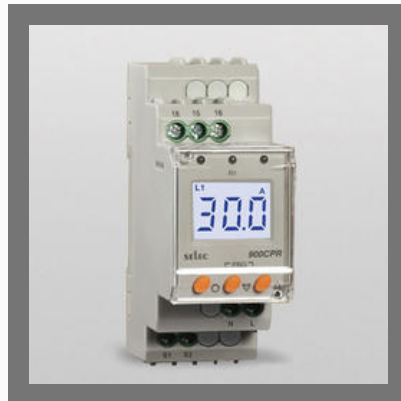
Digital Current Protection Relay_900CPR-1-BL-U