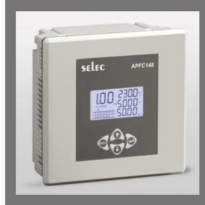
APFC, LCD, Communication_APFC148