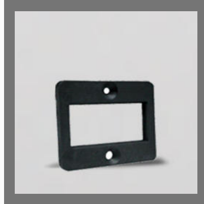
Adapter Plate, 50x50mm In 60x60mm Cutout AP6050