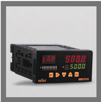
PLC, HMI, 8DI 5RO 1AI(TC/RTD, 0-10V, 0- 20mA) MM1010