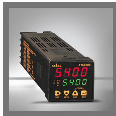
Programmable Counters & Timer_XTC5400