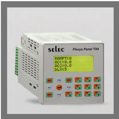
PLC, 4 line 16 Character LCD HMI Modular_Flexys TX4