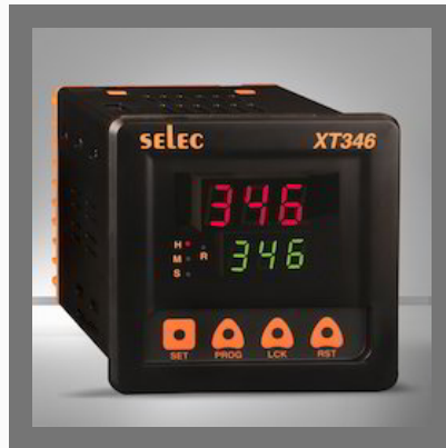
Dual Display Multi function Timer