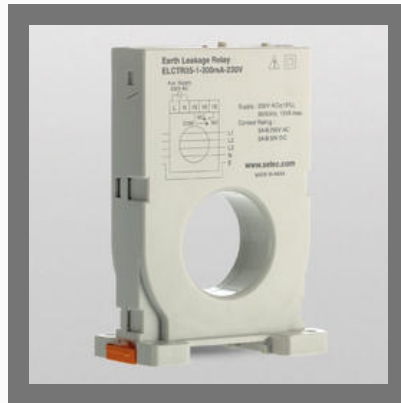
Earth Leakage Relay, With Inbuilt CBCT_ELCTR