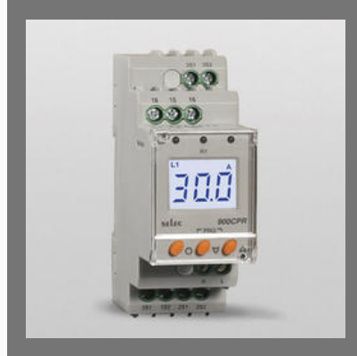
Digital Current Protection Relay, 900CPR-3-1-BL