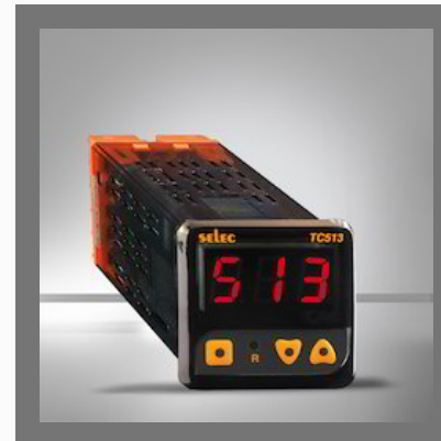
Single Display- Set Point Temperature Controller_TC513AX