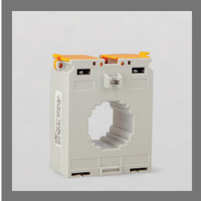
Current Transformer _ SPCT