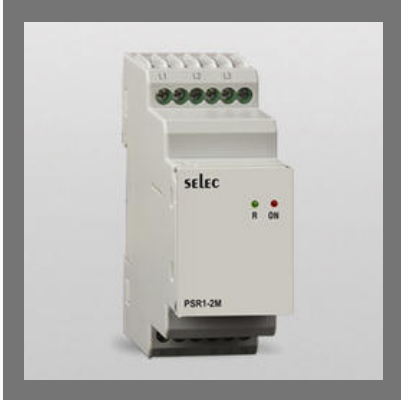
Phase Sequence Relay, 1C/O (SPDT)_PSR1