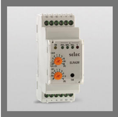
Analog Earth Leakage Relay_ELRA2M