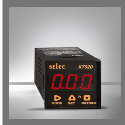
3 Digit Programmable Timer