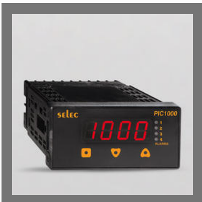
Process Indicator With Retransmission PIC1000N