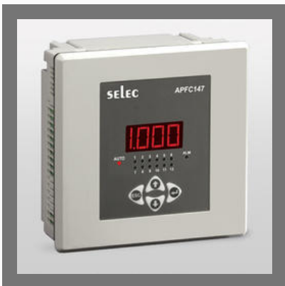
APFC, LED, 1 CT Sensing_APFC147