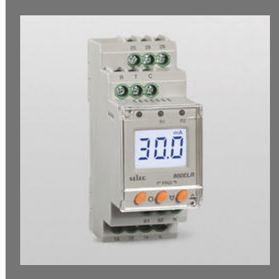
Digital Earth Leakage Relay_900ELR