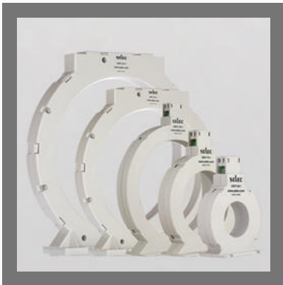
Earth Leakage Relay Accessory CBCT, 1000:1