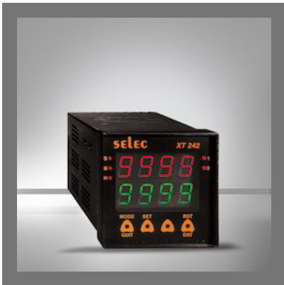
Dual Set Point Timer