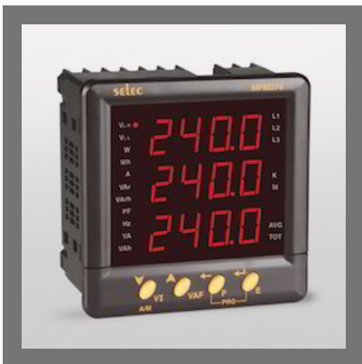
Meter, Multifunction, LED, Import/Export Energy _MFM374