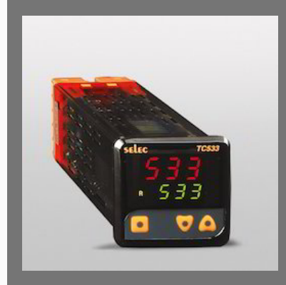
Dual Display-Single Set Point-Temperature Controller_TC533AX