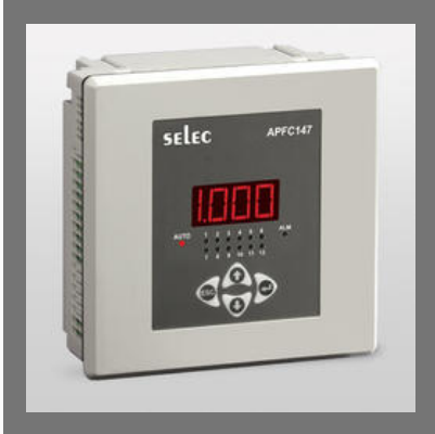
APFC LED 3 CT Sensing_APFC147