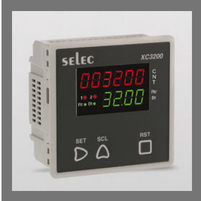
Counter, RPM Indicator_XC3200