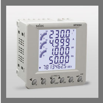
Meter, Multifunction, LCD, Harmonics- MFM384