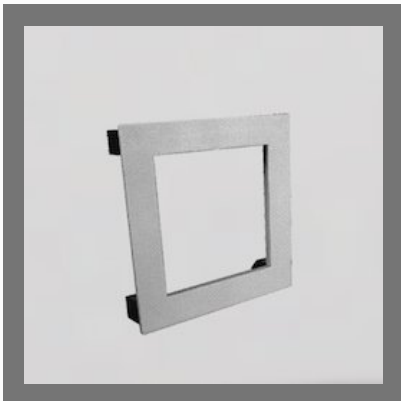
Adapter Plate, 72 X 72 Mm In 96 X 96 Mm Cutout_AP9672