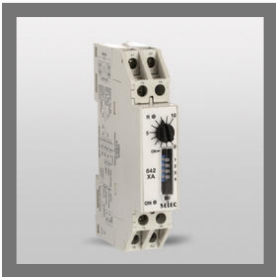
Timer, 2 Functions, Universal Supply_642XA