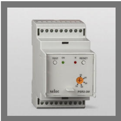
Phase Sequence Relay, Auxiliary Supply PSR2