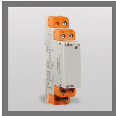
Phase Sequence Relay,17.5mm 600PSR