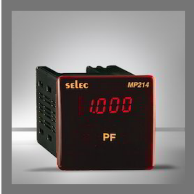
Digital Power Factor Meters