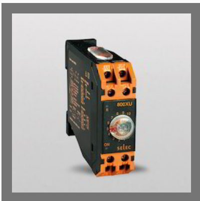
Timer, On Delay/Interval, 12 Time Ranges_800XU